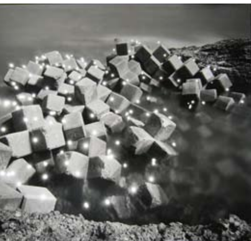
Tokihiko Sato, #340 Yura, 1998. Gelatin silver print, 19 7/8 x 23 7/8 in.

Bold Improvisation: 120 Years of African American Quilts