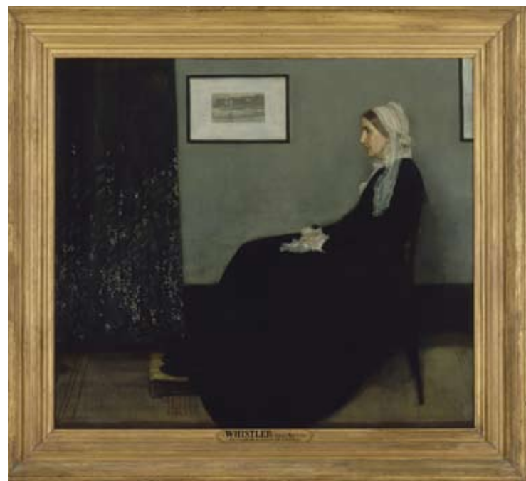
James Abbott McNeill Whistler. Arrangement in Grey and Black No. 1 (also called Portrait of the Artist's Mother ), 1871. Oil on canvas, 56 7/8 x 64 in.

In 2010, the Frist Center continued to present important works of art from around the world. The first of three major exhibitions in the Ingram Gallery, Masterpieces of European Painting from Museo de Arts de Ponce included works collected by Puerto Rican businessman and politician Luis Ferré. Highlights ranged from masterpieces of the late Gothic and High Renaissance