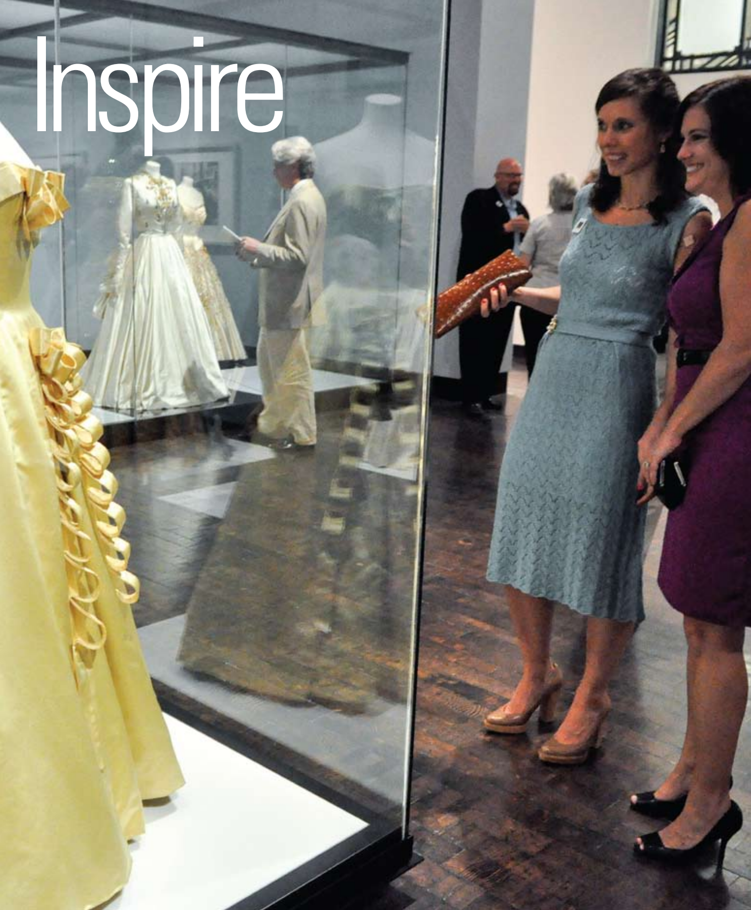
The Golden Age of Couture: Paris and London 1947–1957. Exhibition organized by the Victoria and Albert Museum, London.

“I LOVE this exhibition! I could kiss whoever brought this to the Frist Center.”