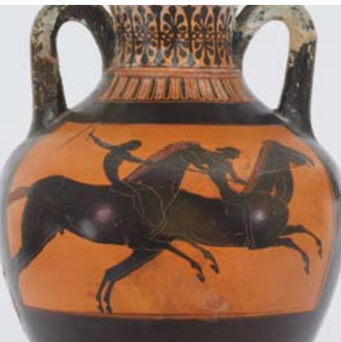
Evening dress by Pierre Balmain. Printed silk, 1957. L'Officiel March 1957.

The Birth of Impressionism: Masterpieces from the Musée d'Orsay