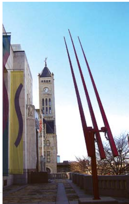
George Rickey. Three Red Lines , 1966. Painted stainless steel with hydraulic devices, mounting screws and braces, 444 x 51 1/4 inches. Hirshhorn Museum and Sculpture Garden, Smithsonian Institution, Gift of the artist through the Joseph H. Hirshhorn Foundation, 1972, acc. no. 72.248 Art © Estate of George Rickey/Licensed by VAGA, New York, NY

Young Tennessee Artists: 2008 Statewide Advanced Placement Studio Art