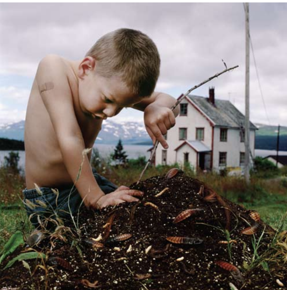
Simen Johan, Untitled #86 , from the series Evidence of Things Unseen , 2000. C-Print, 44 x 44 in.

Presence or Absence: The Photographs of Tokihiro Sato