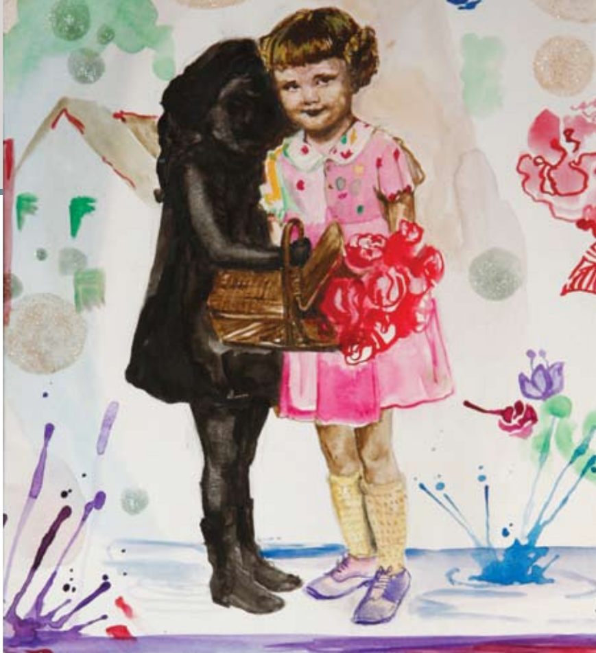
Juliana Horner. Memory , 2010. Gouache and nail polish, 8 1/4 x 7 in.

Seeing Ourselves: Photographs of Safe Haven