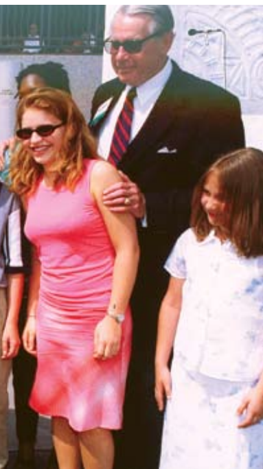
Opening Day: April 8, 2001